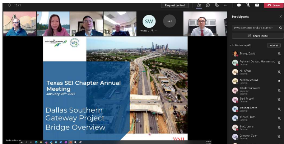
Presentation 1: Dallas Project